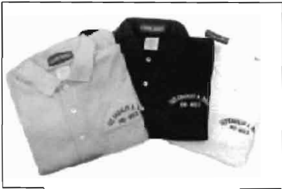
Item #1 Embroidered Golf Type shirts (with pocket)

Blue/Gold Lettering Light Blue/Blue Lettering White/Blue Lettering Tan/Blue Lettering