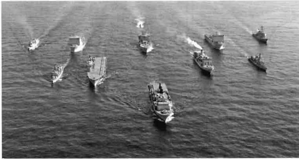
HMS Bulwark spearheading. Following behind (left to right): second row: HMS Argyll, HMS Ocean, RFA Fort Austin, HMS Somerset third row: FNS Duplex, RFA Mounts Bay, RFA Wave Ruler, RFA Lyme Bay, USS Mitscher rear: Submarine HMS Talent.

Under the clear blue skies of the Mediterranean, the eleven ships of the Royal Navy's Taurus 09 deployment line up, led by the Flagship HMS Bulwark.