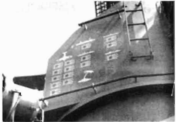
Battle Honors - Mt52 - USS Taylor DD-468

The first US Navy ship to anchor in peace in Japanese coastal waters at the end of World War II was a destroyer that, wrote Admiral Halsey, "admirably performed every mission assigned to her." A lucky ship, USS Taylor, DD 468 earned 16 battle stars through three years of hazardous service in every major Southwest Pacific campaign from the Solomon Islands to Tokyo Bay, from which she emerged without casualties and nearly without a scratch.