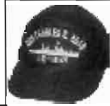
Item #6 Ball Cap Blue hat with gold ship and lettering with either Before 1961 silhouette or After 1961 silhouette both $17.00 (please indicate silhouette preference)