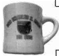
Item #4 Cup Lettering in gold Colored Ship's Logo $12.00

only a limited amount in stock Not Framed $12.00