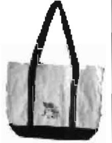
Item #3 Tote Bag Royal Blue/Ash Ships Logo Pocket 14X17X5 $12.00