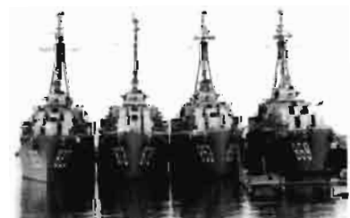
The United States Navy sometimes sent ships from the Atlantic fleet to the Pacific Ocean. The four ships in Destroyer Division 101, based in Newport, R. I., took part in such a deployment. Upon completion of their Far East mission the ships continued west to complete a circumnavigation of the world. For the sailors involved it was a never-to-be-forgotten experience. The Adventure of a Lifetime!