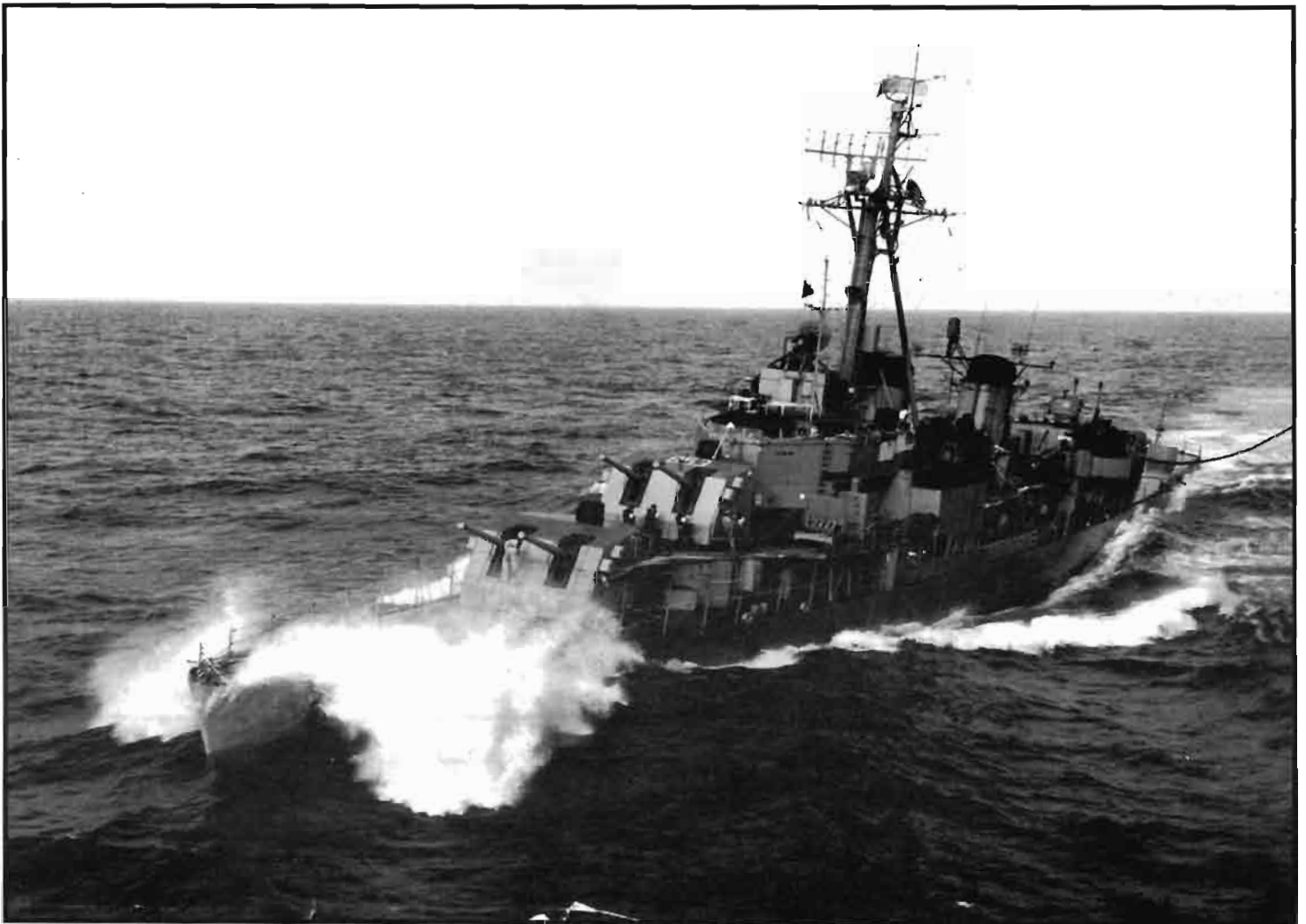
“Med” Cruise 1960